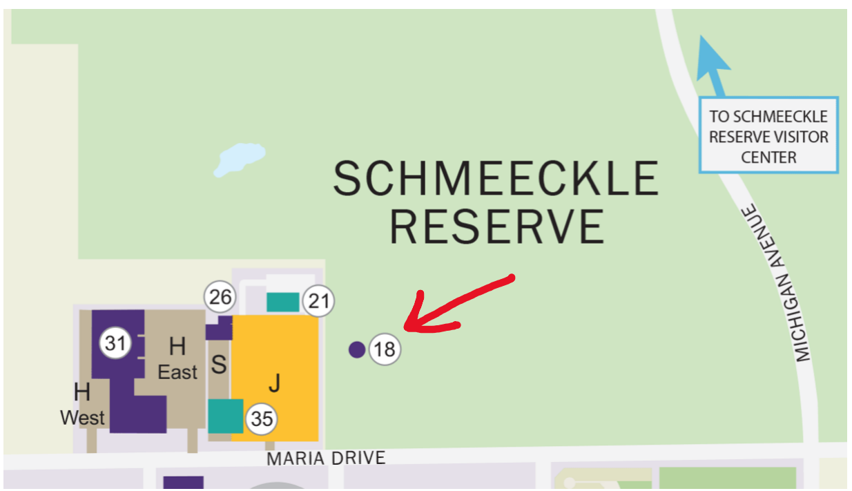
Figure 2. Map of Schmeeckle showing the meeting location at Schmeeckle pavilion, labeled number 18.